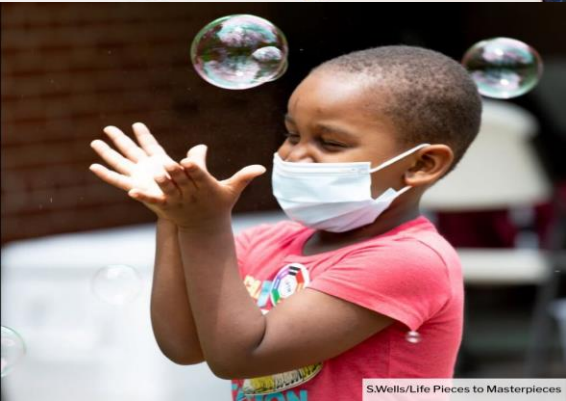
S.Wells/Life Pieces to Masterpieces